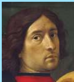
BERTOLDO DI GIOVANNI